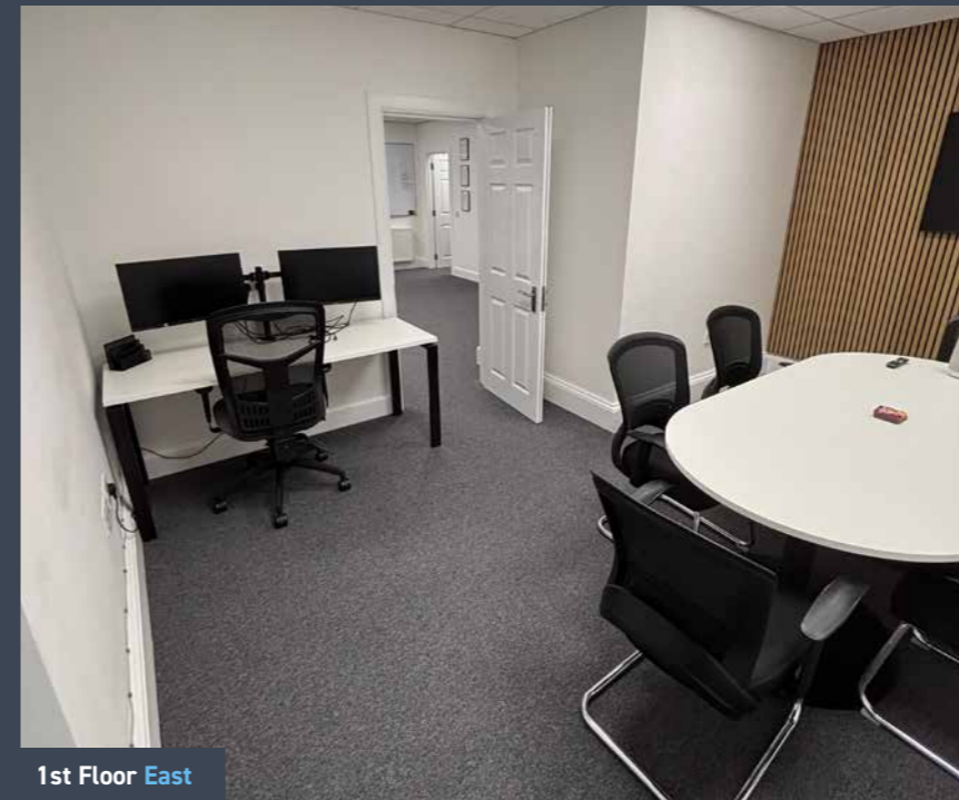
1st Floor East