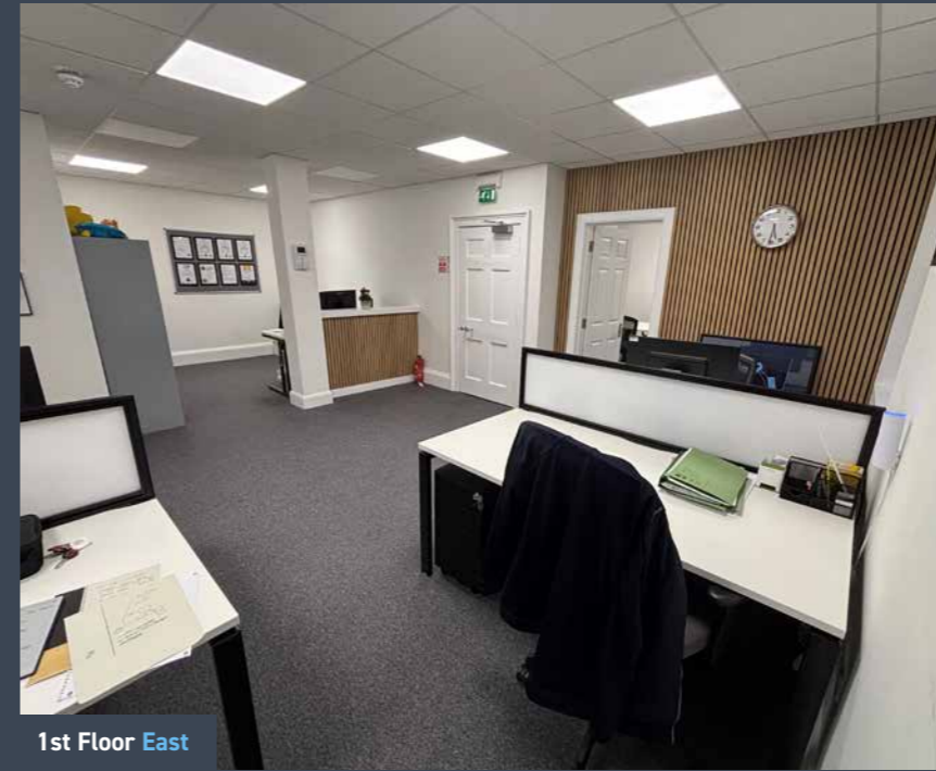
1st Floor East

The dual aspect office suites offer excellent levels of natural daylight and both suites have tea prep areas in situ.