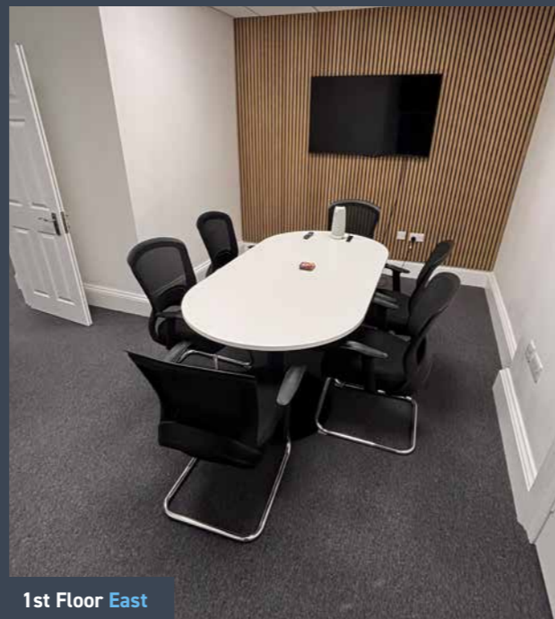
1st Floor East