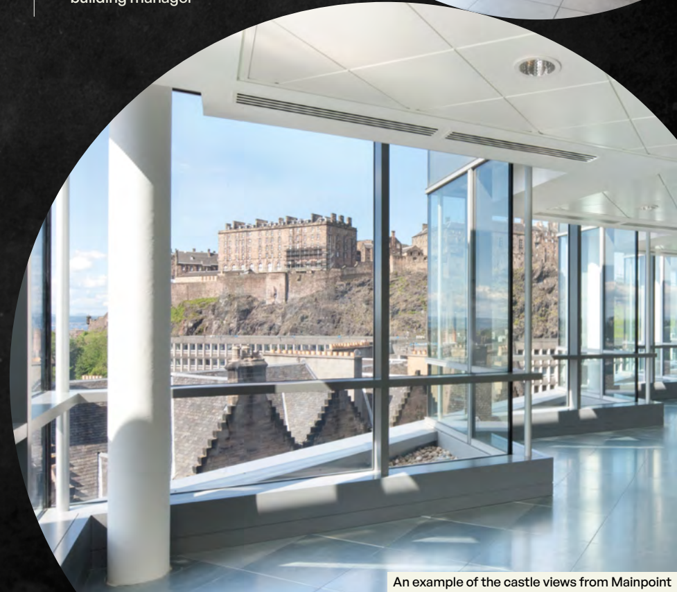
An example of the castle views from Mainpoint