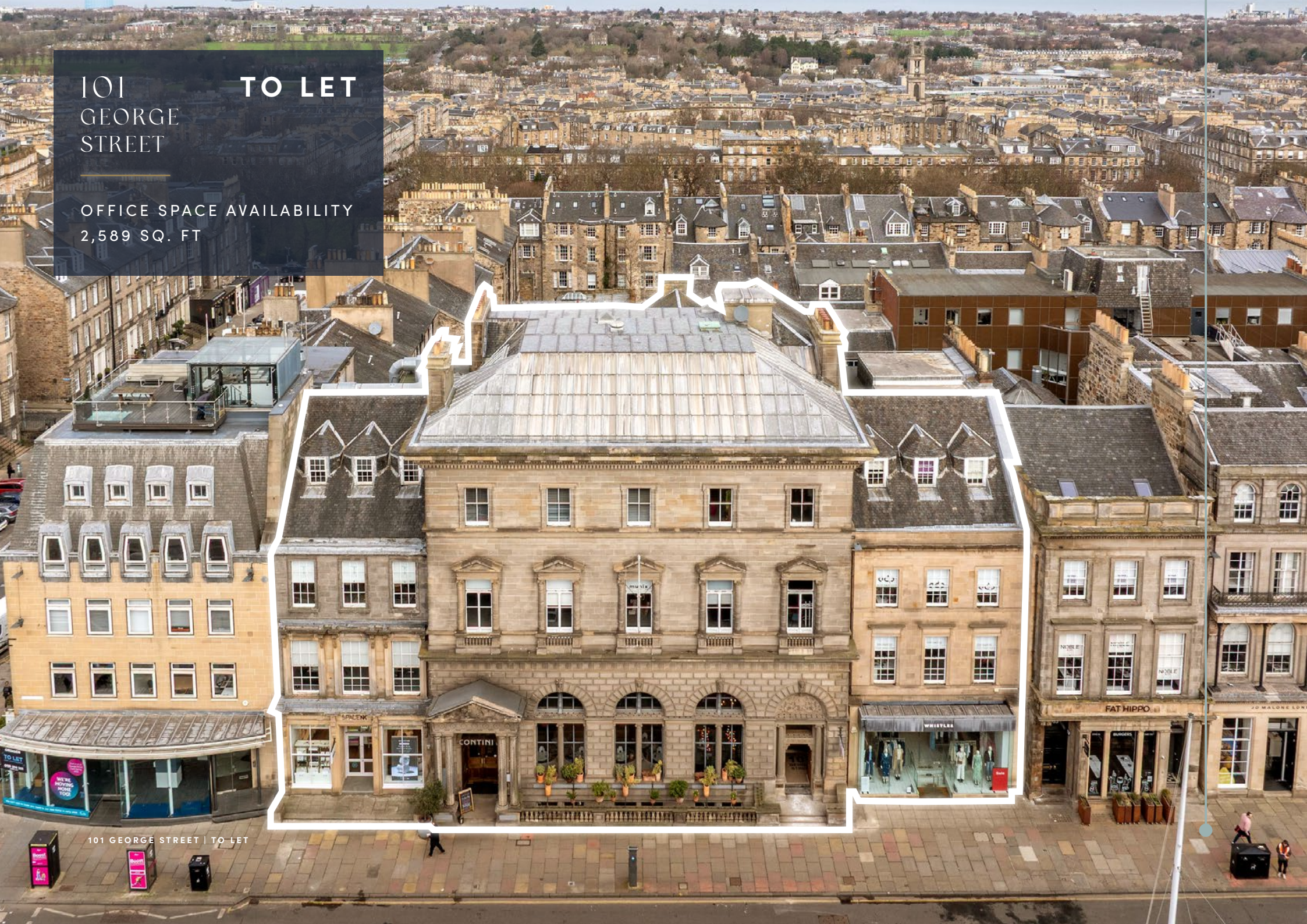
101 GEORGE STREET | TO LET